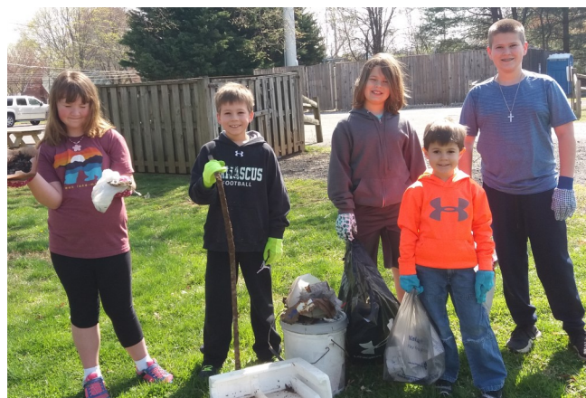
The Sunday School children did their part to celebrate Earth Day by cleaning up the grounds and planting flowers!!!

There will be a Missions Committee meeting on May 22. Please see any committee member if you have a project you wish us to consider.